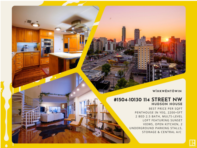
#1504 10130 114 STREET HUDSON HOUSE OLIVER, EDMONTON